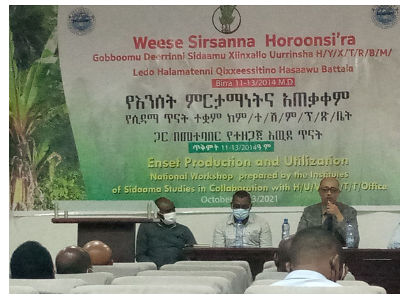
- 1 Enset workshop

This workshop was held in HU on 20 November 2021 in Africa Hall.