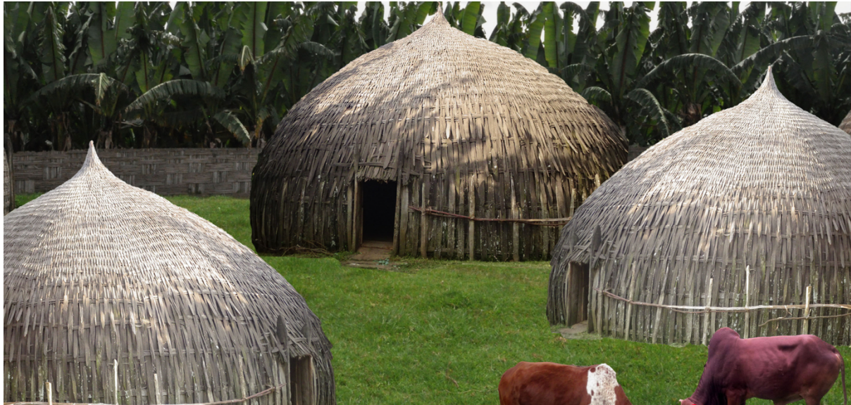
Malga hut style